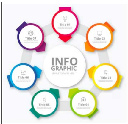
Example 6: Infographic

Infographics combine data, images, and text to present complex information in an easy-to-understand format. They are particularly useful for communicating insights to non-technical stakeholders.