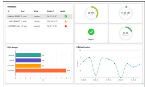
Example 2: Real-Time Monitoring Dashboard