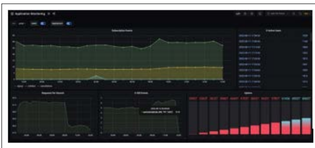
Example 1: Real-Time Monitoring Dashboard